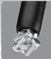
Hands-free tail cap magnet