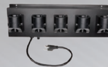
Five bank charger