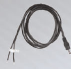
Direct wire kit

*Limited Lifetime Warranty • Product is warranted to be free from defects in workmanship and materials for the original purchaser's lifetime. The Limited Lifetime Warranty includes the LEDs, housing and lenses. Rechargeable batteries, chargers, switches, electronics and included accessories are warranted for a period of two (2) years with proof of purchase. Disposable, non-rechargeable batteries are excluded from this warranty. Normal wear and failures which are caused by accidents, misuse, abuse, faulty installation and lightning damage are also excluded.