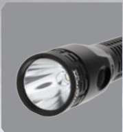
High-efficiency deep parabolic reflector